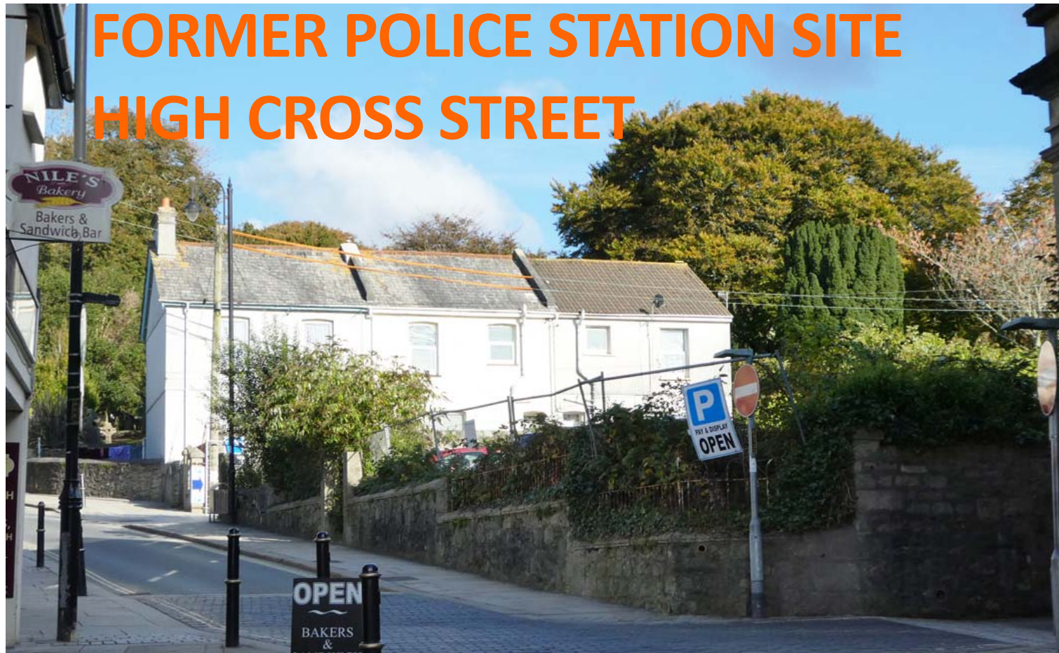
Above: View looking up High Cross Street towards the station and the adjoining terrace. The stepped stone wall is a good historic feature